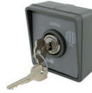
MYRS_ key switch