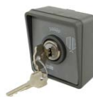
MYRS_ key switch