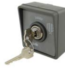
MYRS_ key switch